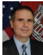
Jeffery Neill Contracting Division